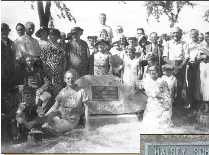
Halsey School site marker dedication