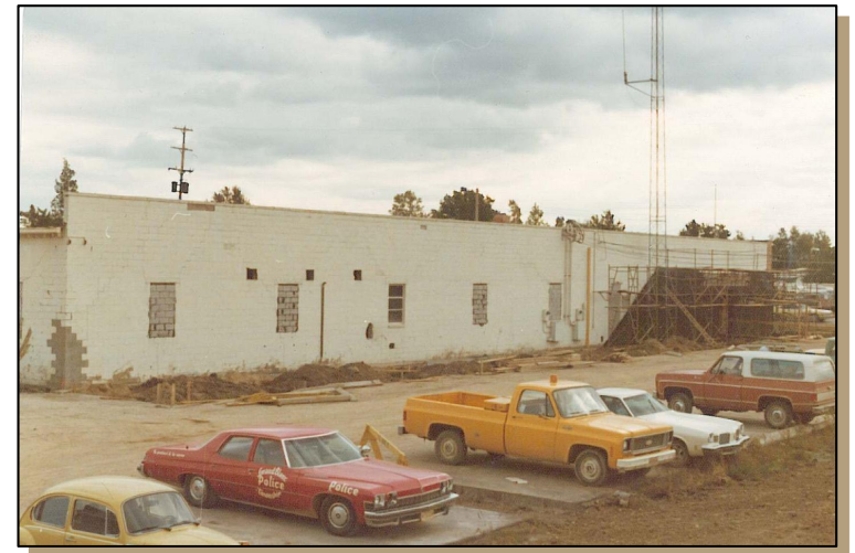
The north wall (building entrance) under renovation in 1975

Other Buildings/Features: Several storage/maintenance buildings, water tower, and new police station.