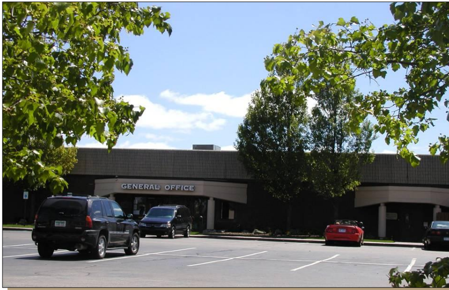
The north wall (building entrance) today.