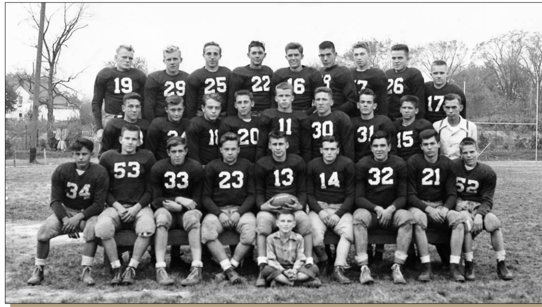
1948 Football Team