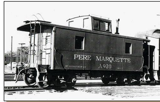
PM caboose in Saginaw - July 1949.