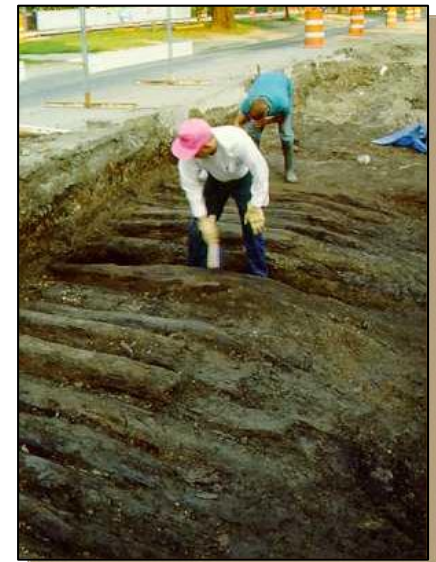
Uncovering the base of an old plank road in East Lansing

History/Descriptive Notes: In the mid 1800s, as more people settled in the Grand Blanc Territory, traveling from village to village became a necessity. Roads, often times old Indian trails, were very treacherous to travel. In the late 1840s the idea of plank roads was established and companies were formed to finance and constructed these roads made of wide hewn timber planks. They were built throughout Michigan. In fact, Michigan was one of the leaders in plank road construction. Historic records state that Fenton, Holly and Saginaw Roads were originally plank roads, which allowed for travel between the Flint and Holly communities. Stage coach stops were located along these routes. The Gibson Tavern in Gibsonville (Whigville) was one stop located in the township as it is known today. However, funding was scarce, so to reimburse investors they became toll roads. It didn't take long for this "new" method of road construction to fall by the wayside. Although there are no remains of the plank roads today, they represent a unique place in the development of our roadway system. A marker commemorating these "original" roads is worth considering.